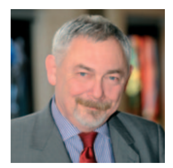
Jacek Majchrowski Mayor of the City of Krakow

Modern local governments are currently facing completely different challenges than just a couple of years ago. If they plan to revitalise, modernise or create a new space, they cannot make arbitrary decisions.